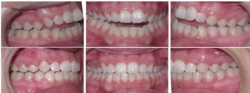
Fig. 2. Case 1: preoperative (upper row) and postoperative (lower row) occlusion including perioperative orthodontic treatment.