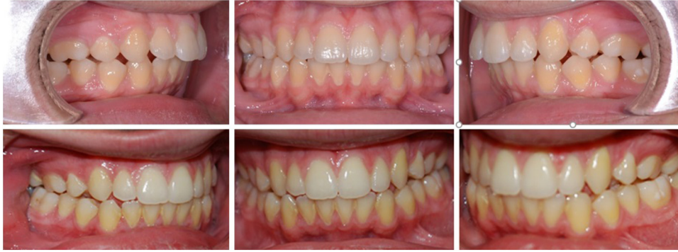
Fig. 5. Case 3: preoperative (upper row) and postoperative (lower row) occlusion. The patient refused orthodontic treatment.

ventions that involve alloplastic implants in the paediatric and young adult population. Indeed, these same concerns related to IACS injections have been raised in this group. Traditionally, neurocranial growth—including the lateral temporal bone, glenoid fossa, and eminence—is considered to be 95% complete by approximately 10 years of age. The sphenoccipital synchondrosis typically begins to fuse in early adolescence (12–15 years of age), and at this time maxillary and zygomatic growth has also nearly ceased. 18 With regards to growth, there are three questions that we wish to address: