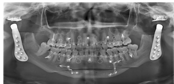
Fig. 4. Case 3: postoperative panoramic radiograph.

was being treated with methotrexate. Her chief complaint was occasional mild to moderate pain in the left TMJ with intermittent open lock. She denied baseline TMJ pain. Her initial physical examination revealed MIO of 42 mm and