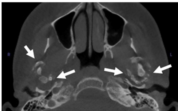
Fig. 3. Case 3: axial cut through the right and left temporomandibular joints demonstrating appreciable bilateral pericondylar heterotopic bone formation (white arrows).